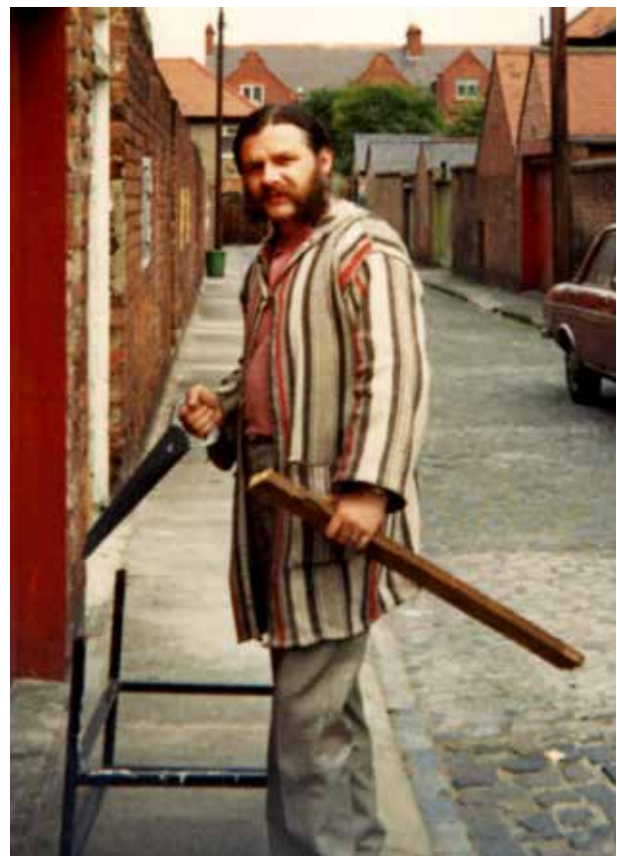
Carpentry in a kaftan, 1979.