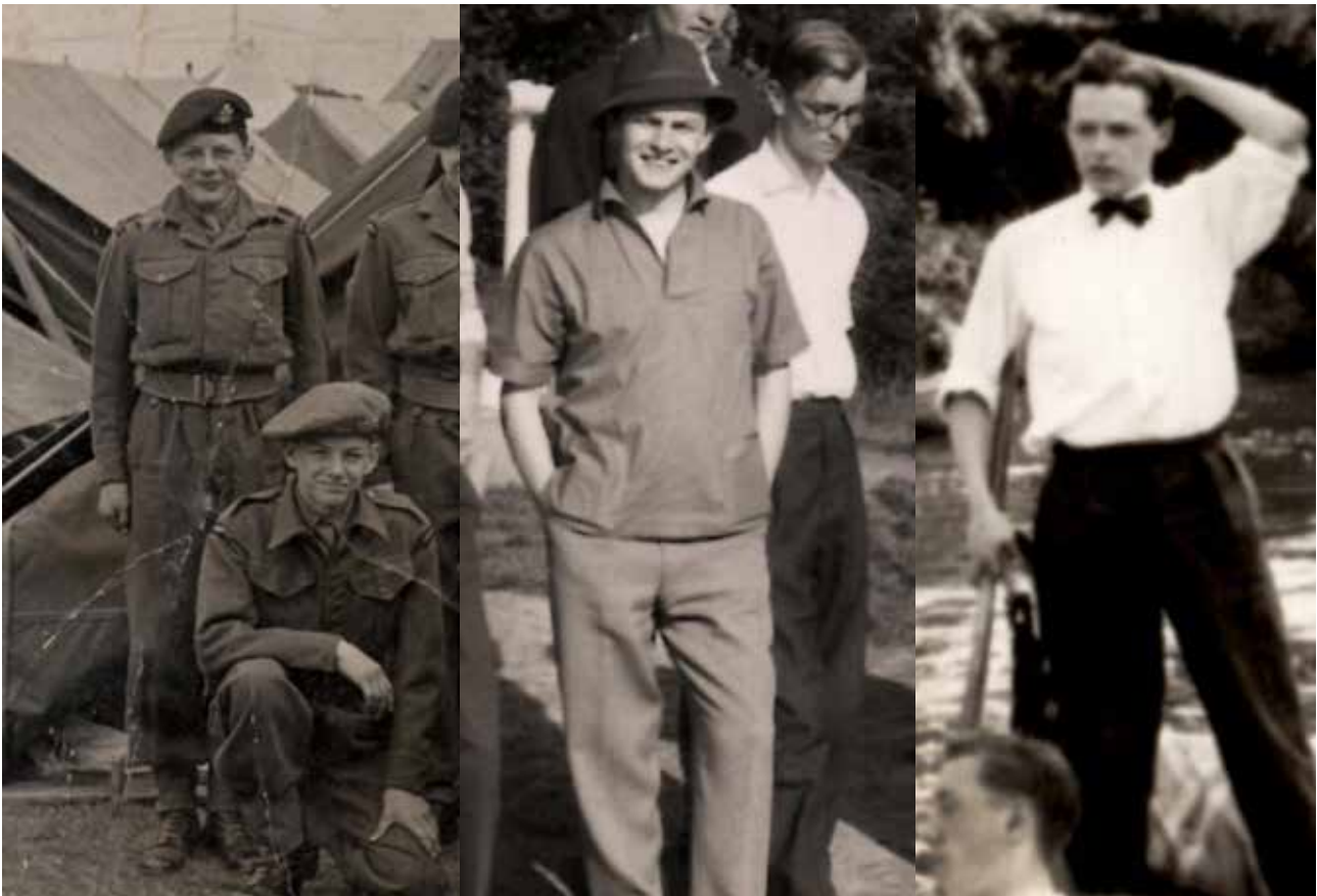
Left to right: The schoolboy Army Cadet; Early 60s headgear; boating in a bowtie.